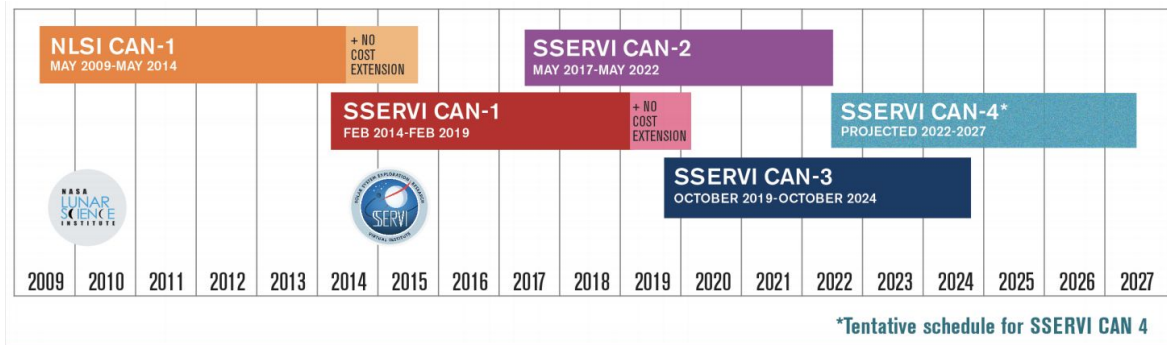
Figure 2: SSERVI Cooperative Agreement Notice (CAN) Roadmap

provides a continuity to the institute, fosters collaboration, and helps ensure an alignment in core research areas, such that investigations are strategically focused to avoid duplicative efforts between teams. Sharing students, facilities and resources also reduces cost and enhances institute effectiveness. With stable funding it also provides secure, long-term funding for graduate students and postdoctoral positions. As compared to small, individually awarded grants, this kind of interdisciplinary, multi-institutional research would be difficult or would not have been possible in the absence of this funding model.